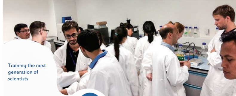
Training the next generation of scientists