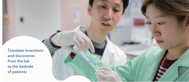
Translate inventions and discoveries from the lab to the bedside of patients