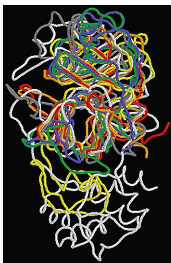
Figure 3. The superposition of SARS-CoV main proteinase (1Q2W, white) with other proteases: 1L1N (Poliovirus 3c Proteinase, red), 1CQQ (Rhinovirus 3c Protease, orange), 1MBM (Nsp4 Proteinase From Equine Arteritis Virus, yellow), 1DY8 (Hepatitis C Virus Ns3 Protease, blue), 1QA7 (Hepatitis A Virus 3c Protease, gray), and 1DF9 (Dengue Virus Ns3-Protease, green).

conducted the docking studies of KZ7088 (a derivative of AG7088) to the SARS-CoV main proteinase (based on a theoretical model). Here, we studied the possibility of other inhibitors in anti-SARS drug development. Figure 4 shows the structures of docking other inhibitors from HAV, HCV and Dengue virus to SARS-CoV main proteinase, the residues that make contact with these inhibitors are marked as '#' in Figure 2. Furthermore, the corresponding binding pockets are shown in Table 1. The results reveal that these inhibitors can bind to SARS-CoV main proteinase well.